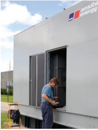
Figure 3. Regular exercise and maintenance of the complete power system are very important factors in high reliability.